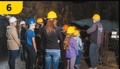
6 Walimskie Addits „Riese” ul. 3-go Maja 26, 58-320 Walim, www.sztolnie.pl

In 1943, the Germans started construction works at a massive scale in the Owl Mountains region. Those works, never completed, were code-named „Riese” („The Giant”). Their remains constitute a number of buildings the purpose of which is shrouded in mystery. The 500-metrelong underground route for tourists has been enhanced with audio-visual effects referring to the World War II and the works related to drilling underground corridors.