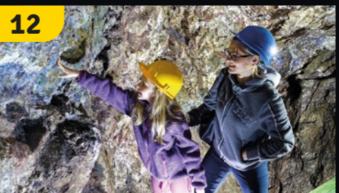
12 Uranium Mine in Kletno Kletno 40, 57-550 Stronie Śląskie, www.kletno.pl

The Uranium Mine in Kletno is a magical place. Its claim to fame is the occurrence of colourful local minerals such as fluorspar, amethyst, malachite and barite. While walking through a maze of colourful corridors, the visitors have a chance to familiarise themselves with Kletno’s 600-year history of mining. Our special exhibition takes back in time for a prehistoric journey showing 500 million years of evolution based on the geological history of the Śnieżnik Mountains.