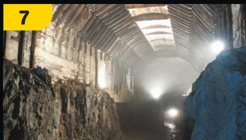
7 Underground City Osówka ul. Świerkowa 29 D, Sierpnica, 58-340 Głuszycza, www.osowka.pl

This military facility, code-named „Riese” was built in the Owl Mountains by the Third Reich in 1943-45. Visitors can see guardrooms, technical corridor and a massive hall with its original 10-metres-tall formworks dating back to the late 1944, as well as some overground buildings, e.g. casino – overground command centre, power station – foundations of the power station prototype, railway siding.