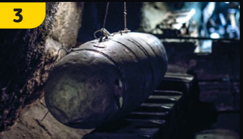
3 The „Project Arado” Underground Tourist Route ul. Lubawska 1a, 58-400 Kamienna Góra, www.projektarado.pl

This is the only underground tourist attraction in Poland, where tourists take on the role of agents of Polish intelligence. This is not an ordinary tour. The guide, is a trained “Silent Unseen” (pol. “Cichociemny” – special agent)! The tourists’ task is to photographically document the object and steal the last secret of the Third Reich! Innovative light illumination, German sentries along the route and the largest collection of World War II militaria in the region.