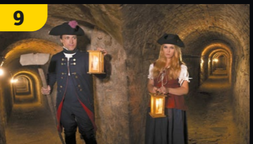
9 Kłodzko Fortress ul. Grodzisko 1, 57-300 Kłodzko, www.twierdza.klodzko.pl

Kłodzko Fortress has lived through the Silesian Wars (mid-18th century) and the Napoleonic campaign (1807). Not only is it a precious record of history, but also a special monument of the fortification engineering concept. Moreover, its location has, until now, constituted a real challenge for the conquerors. What makes the fortress so special, is a complex and unique system of underground corridors in Europe, colloquially called the underground maze.