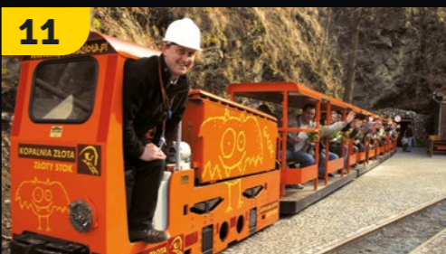
11 Złoty Stok – Gold Mine ul. Złota 7, 57-250 Złoty Stok, www.kopalniazlota.pl

The Underground Tourist Route Gold Mine was created in 1996. Two extremely interesting addits were then made available for visitors: „Gertruda Addit”, „Czarna Górna Addit” with the only underground waterfall in Poland (8 metres high), and „Czarna Dolna Addit” which you can exit by the Orange Tram. The ancient Ochrowa drift was also made available for visitors. What makes people want to come back to the Gold Mine is the unique fairy tale ambiance of this underground world and an extraordinary way of guiding.