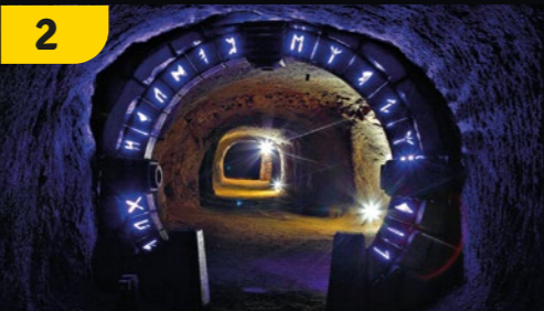
2 Time Gates – Bramy Czasu ul. Chełmońskiego 3, 58-500 Jelenia Góra, www.timegates.pl

Time Gates offers two equally interesting sightseeing formulas. Historical Route – 1,400 meters of underground tourist route, the longest accessible underground in the Karkonosze Mountains. Science Route – an amazing acoustic and visual experience. At Time Gates – Bramy Czasu you will also organize an amazing Birthday Party, where, in addition to experiments and an electric concert, unique nitrogen ice cream awaits the birthday boy or a girl and guests.