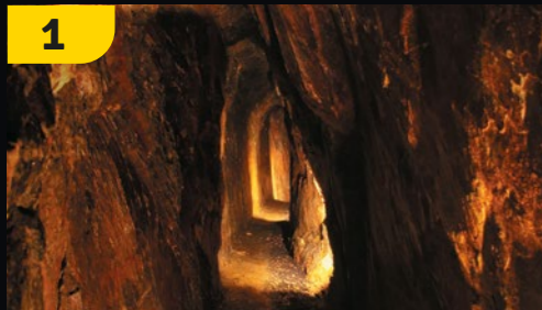
1 Geopark in Krobica „The route of the ancient ways of precious metals mining” Krobica 90, 59-630 Mirsk, www.podziemna-wieza.pl

Geopark – this tourist and educational „Route of the ancient ways of precious metals mining” is an underground 350-metrelong passage through two addits and 13 posts alongside the 8-kilometrelong ground route. The visitors start in the exhibition vestibule and move on to the excavation of the 18th-century addit of St Leopold. Then, using the interfloor shaft, they get to the drift of St John (16th century) situated 10 metres higher. What you can see there, are the remains of the tin ore excavations.