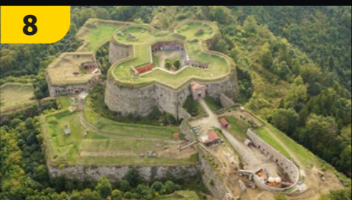
8 Srebrna Góra Fort ul. Kręta 4, 57-215 Srebrna Góra, www.forty.pl

Fort Srebrna Góra is a unique sight in terms of European cultural heritage. At the time of its construction (1765-1777), it was one of the most modern forts of this kind in Europe. The fort is visited with a guide in a historical Prussian uniform. The whole complex consists of six forts and a few bastions. There used to be 151 fortress chambers (casemates) there, situated on three storeys.