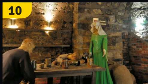
10 Kłodzko – Underground Route ul. Czeska, 57-300 Kłodzko, www.podziemia.klodzko.pl

The underground corridors and tunnels situated below the city were drilled between the 13th and 17th century and intended to serve as storage rooms. The compartments went as deep as 30 metres below the ground and the low temperature there enabled to keep the food fresh. Whereas during wars, they were used as shelters. The route is about 600 metres long and it is one of the most interesting ones in Poland. During the visit, you can hear sounds of the city from the past and sounds of the battle.