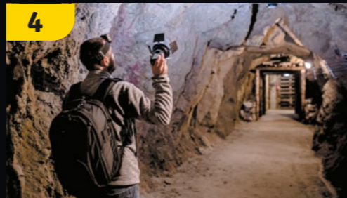
4 Książ Underground ul. Piastów Śląskich 1, 58-306 Wałbrzych, www.ksiaz.walbrzych.pl

Tunnels built during World War II by the German army and intended to serve as storage rooms. The compartments went as deep as 30 metres below the ground and the low temperature there enabled to keep the food fresh. Whereas during wars, they were used as shelters. The route is about 600 metres long and it is one of the most interesting ones in Poland. During the visit, you can hear sounds of the city from the past and sounds of the battle.